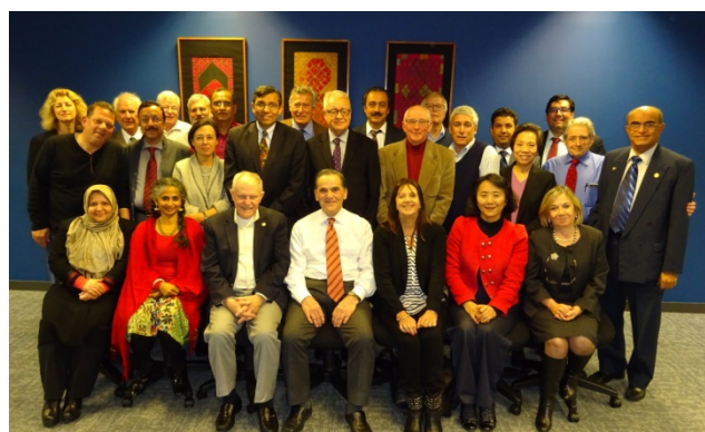
The IPA Executive, Standing Committee members & TAG Chairs during their meeting in March'15, in London, UK